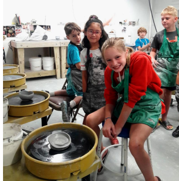
Summer Arts Discovery Camp fun in our ceramics studio!

To see our full list of summer camp offerings click HERE .