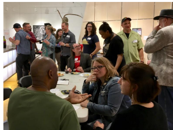
Local artists gather at Creative York to share food and camaraderie at one of our Artists' Feast pot luck events.